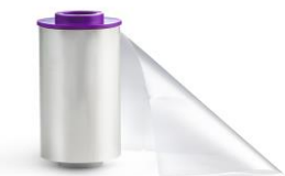
A wasteless lamination roll wherein no carrier film and subsequent take-up core is required.

In contrast, wasteless lamination technology aims to reduce this level of needless waste by eliminating the need for carrier film and thus, a subsequent take-up core. With wasteless lamination, overlaminates patches are attached to one another in a continuous stream of material, on a single roll and without an underlying carrier. As each patch is detached from its supply roll and adhered to a card, the lamination cycle is completed.