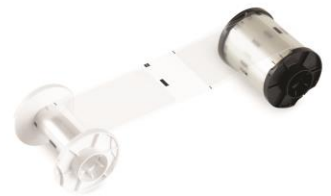
A traditional overlamine roll with lamination patches, carrier film and take-up core.

The first "supply" roll consists of new laminate patches adhered to carrier film that is wrapped around a supply core. The second roll consists only of an empty "take-up" core. When the laminate from the first roll has been adhered to the card, the take-up core then "takes up" the left over carrier film. After the supply roll has been depleted of laminate patches and the take-up core has been filled of subsequent leftover carrier film, the operator then removes both cores along with the used carrier film. Ultimately, this traditional lamination process produces the following waste byproducts: two cores and a full roll of used carrier film - none of which are easily recycled.