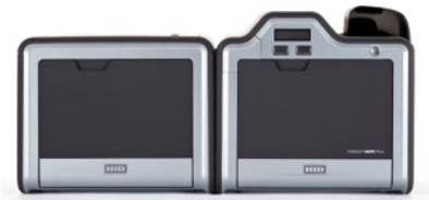
FARGO® HDpii PLUS Financial Printer with lamination