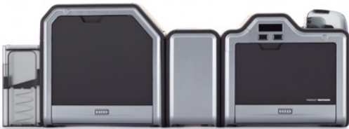
FARGO® HDP5000 with optional dual-sided printing and lamination