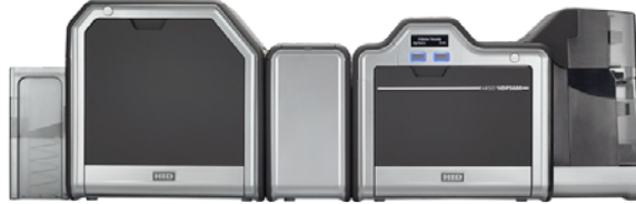
FARGO® HDP5600 with optional dual-sided printing, lamination, and dual card input hopper