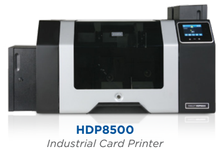
HDP8500 Industrial Card Printer