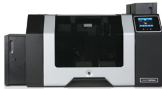
FARGO® HDP8500 Industrial Card Printer